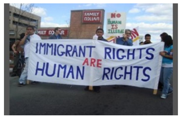
Immigrant advocates regularly make claims using the language of human rights. How do California voters respond to such framing strategies?

The number of unauthorized immigrants in the U.S. has fallen to its lowest level in more than a decade, yet anti-immigrant politicians have achieved significant electoral and policy victories while the pro-immigrant rights movement seems to have lost traction. To understand how pro-immigrant allies might effectively advocate for undocumented people, BIMI-affiliates Kim Voss and Irene Bloemraad, along with co-author Fabiana Silva, asked over three thousand registered California voters what should be done to help California residents — including undocumented residents — needing health care, facing sexual harassment, or going hungry.