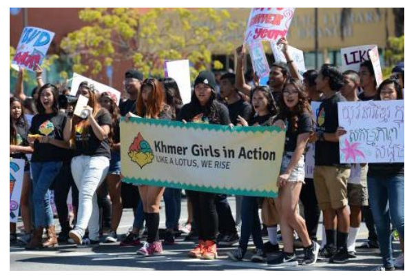
Khmer Girls in Action in 8th annual Cambodian New Year parade, Long Beach, CA.