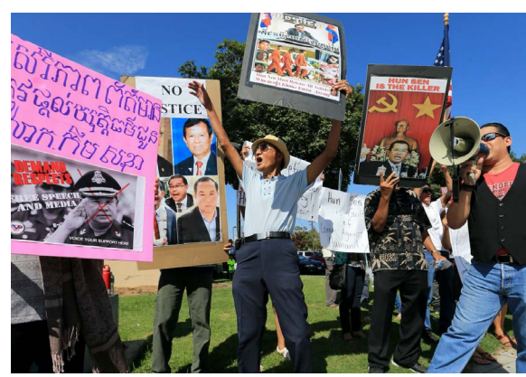
Cambodian Americans protest in Long Beach, CA.

of racism and discrimination present in American society that continue to impede the socio-economic advancement of many immigrant communities, remain a prominent and necessary focus of local youth activism in the Cambodian diaspora. A Cambodian American youth organization from Long Beach, California, Khmer Girls in Action, has not only taken on anti-deportation activism, but also organizes for gender, economic and racial injustice in their community.9 Within this work, youth activists of the Cambodian diaspora connect the marginalization of refugees in the U.S. with social injustices occurring in Cambodia.